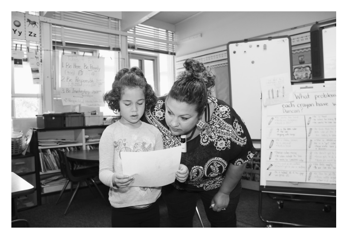
A stereotype about young children is that they think in simple and naïve ways. But all of us who are elementary educators know that our students are far more complex.

insightful and breathtakingly wise. But when we lower our expectations about their ability to contribute to meaningful dialogue, they in turn lower their expectations about themselves. When we expect them to behave as silly beings, they oblige. We pigeonhole them at our own peril when we don't provide the forums they need to be profound; we deprive them of opportunities to experiment with ideas, to be wrong and survive the experience, to be intellectually resilient.