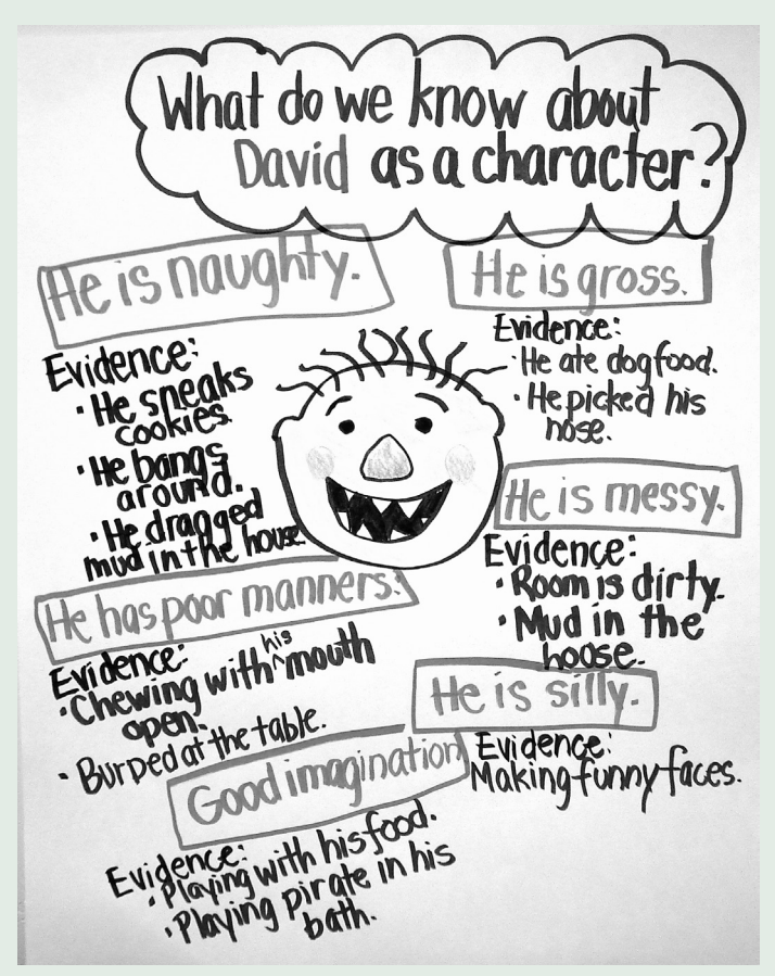
Figure 4.2 Language Chart for No, David!