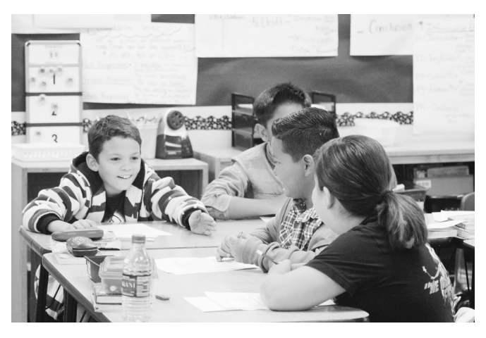
We always view those moments when students stop talking to us and begin talking to one another as a sign of success.

questions about vocabulary and text structure and locating explicitly stated information, we transition students into a heavier reliance on inferences. They are further challenged to use evidence and reasoning in their discussions. Because of this, lessons about what the text means may take longer and will be punctuated by periods of silence as students think closely. You may discover that you're only posing a few of these questions, because it takes students longer to draw conclu-