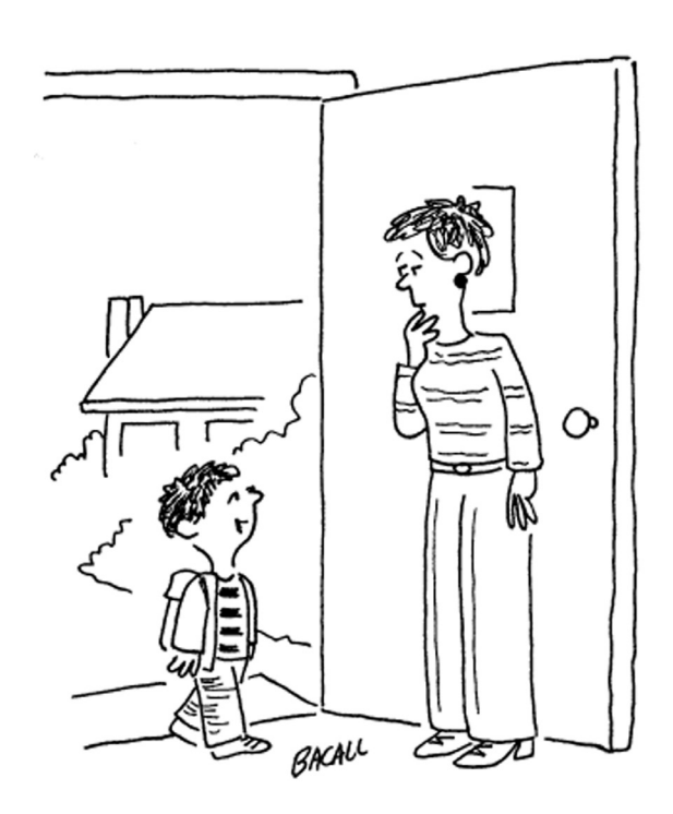
"I raised my hand and asked if I could leave the room, and here I am."

electronics, and everything else, is incredibly short. Thanks to advances in modern technology, we are used to things happening faster and faster—so much so that we don't feel the need to wait. I am as guilty as anyone. I can remember when I used to buy Jiffy Pop popcorn and wait 15 or more minutes to enjoy a delicious bowl of freshly popped corn. I would even have to shake the pan to keep it from burning. Now, I have a difficult time standing at the microwave waiting 2 to 3 minutes for my popcorn. We want what we want, and we want it now!