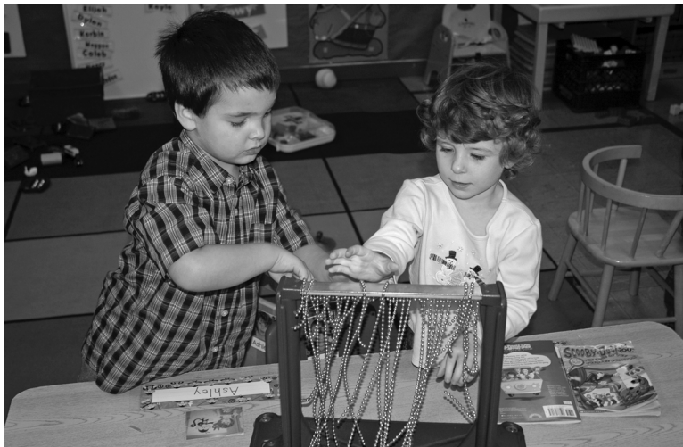
Figure 1.1 Children with special needs learn best in a natural environment.